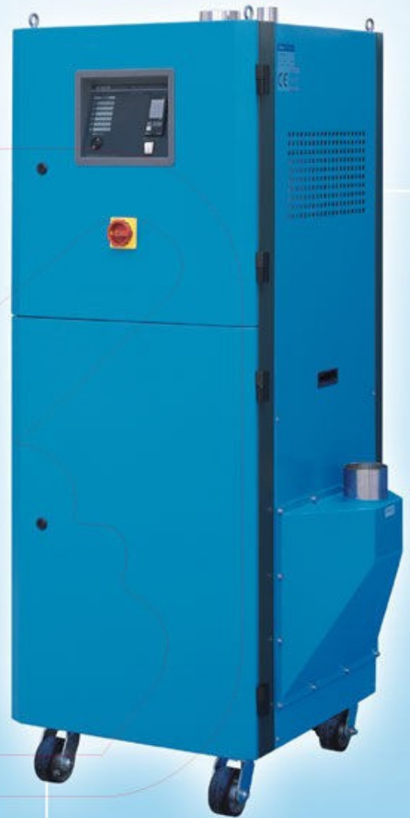
SMD-500 (With return air collector)