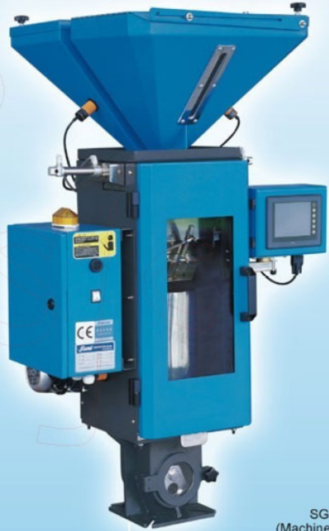
SGB-80-2 (Machine Mount)