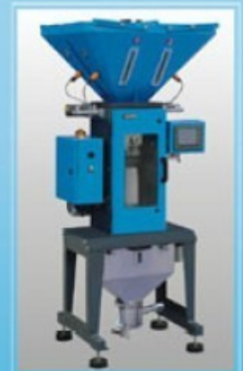
SGB-80-4-2R (Floor Mount)