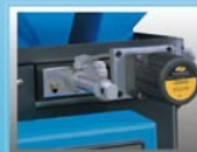
Motor-driven Auger (Option)