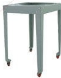
DH-20U~750U model applicable