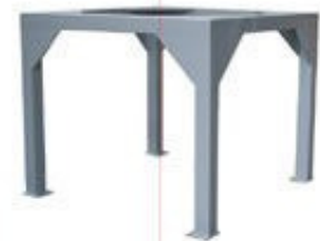
DH-900U above model applicable